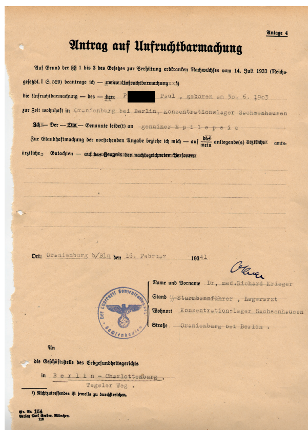
Sterilization application for Paul P., 16/2/1941; anonymization by the author.